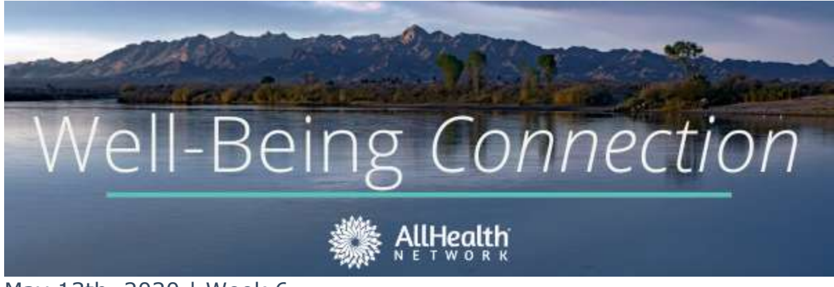
May 13th, 2020 | Week 6

Welcome to the Weekly Well-Being Connection! Each week we will share advice from our clinical experts on ways to care for your mental health and well-being throughout COVID-19.