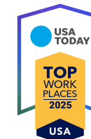
2023-2025 USAToday Top Workplace